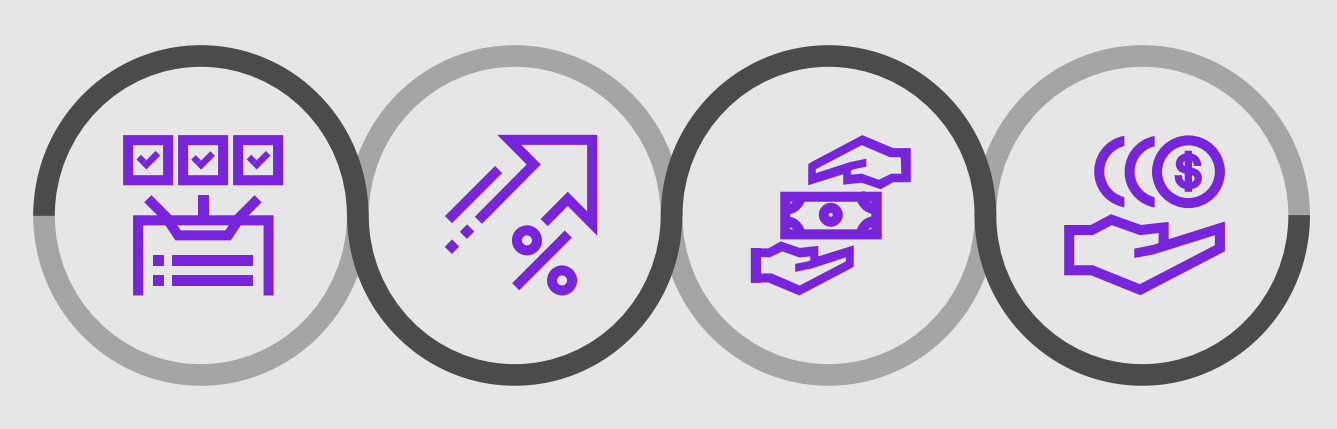
Figure 1 Public policy tools to support digitalization of SMB payments

Creating conditions for a robust, open payments infrastructure